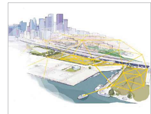
Sidewalk Labs Digital Infrastructure

Just two kilometers from Wonder will be the world’s first ‘smart city’. The brainchild of Sidewalk Labs, a subsidiary of Alphabet (Google’s parent company) it will be a ‘test bed for the combination of technology and urbanism’. A stage for adaptable buildings, people-centred street designs, and new construction methods, a place where digital technology, data, and innovation will improve the quality of life of residents and the planet. It is also slated to house the new headquarters for Google Canada.