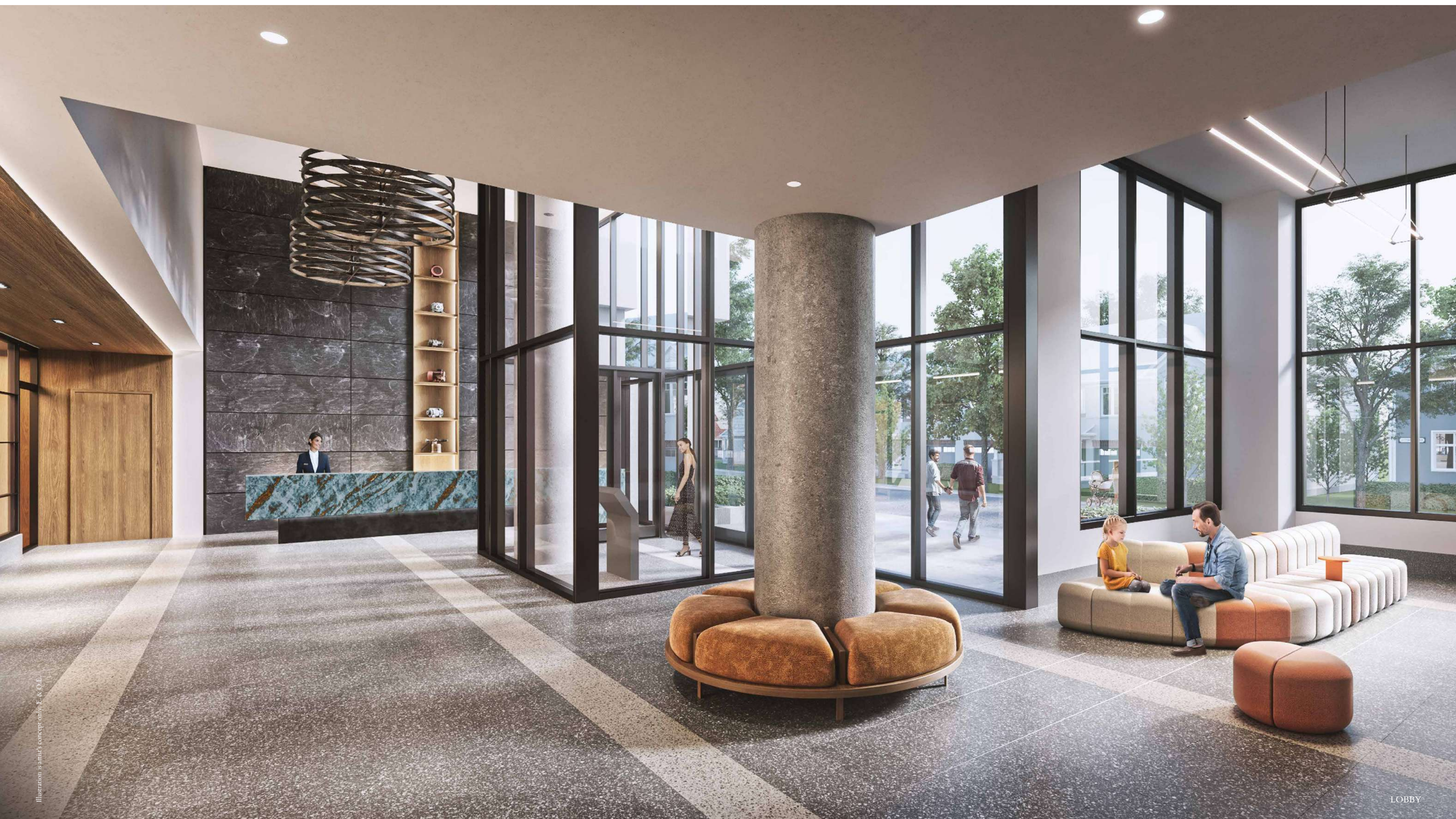
Illustration is artist's concept only. E. & O.L.