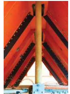
On the cover: Photograph by Laird Kay

[Artist's Statement] Buildings grow, learn, and adapt. They are organic. Just like the bread that was made, proofed, and baked here in this building, the factory is changing, and still has many stories to tell. The details of the equipment have been abstracted and are seen as sculpture, and as graphic design. This building is still a wonder. Wonder: a word that fills us with optimism, stimulates the imagination, and makes us aware of infinite possibilities.