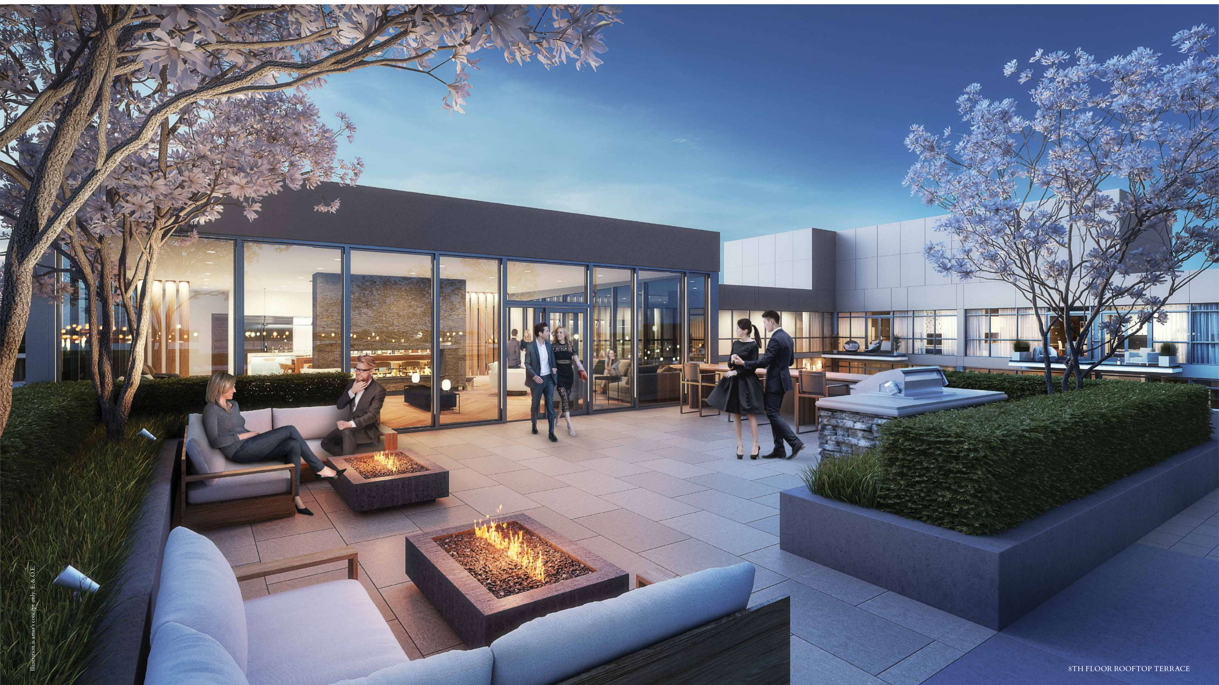
Illustration is artist's concept only. E. & O.E.