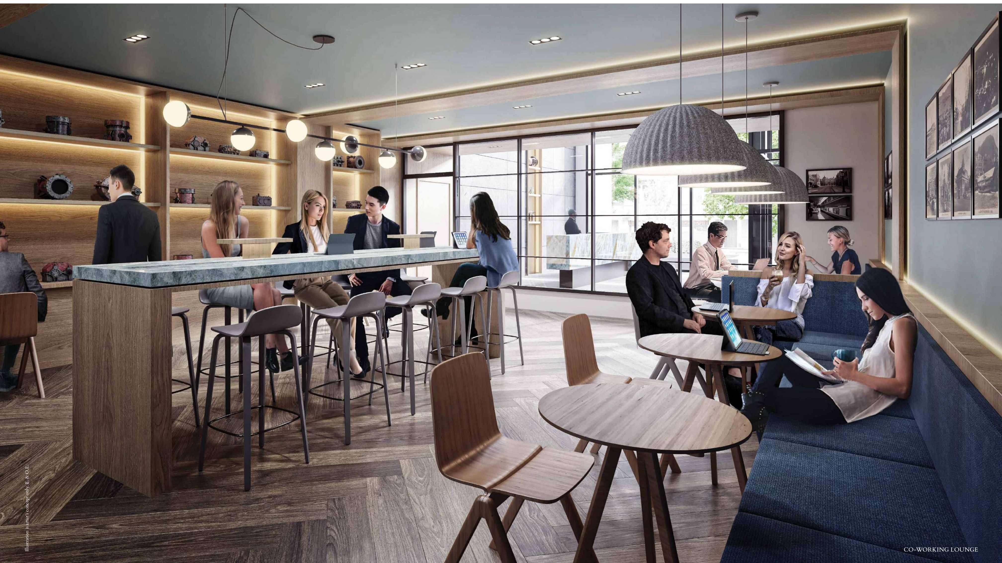
Illustration is artist's concept only. E. & O.E.