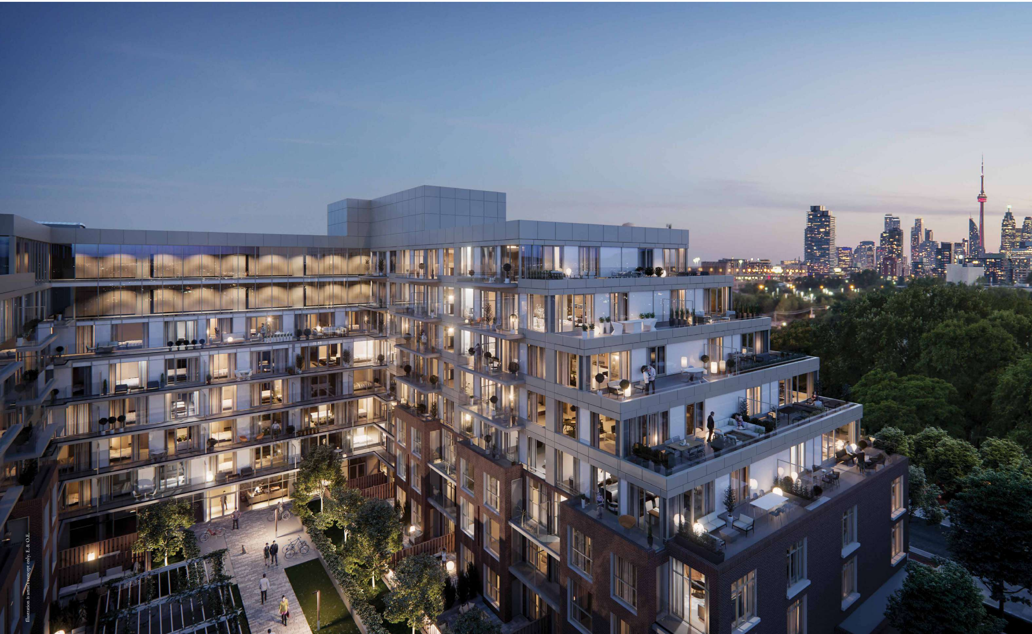
Illustration is artist's concept only. E. & O.E.