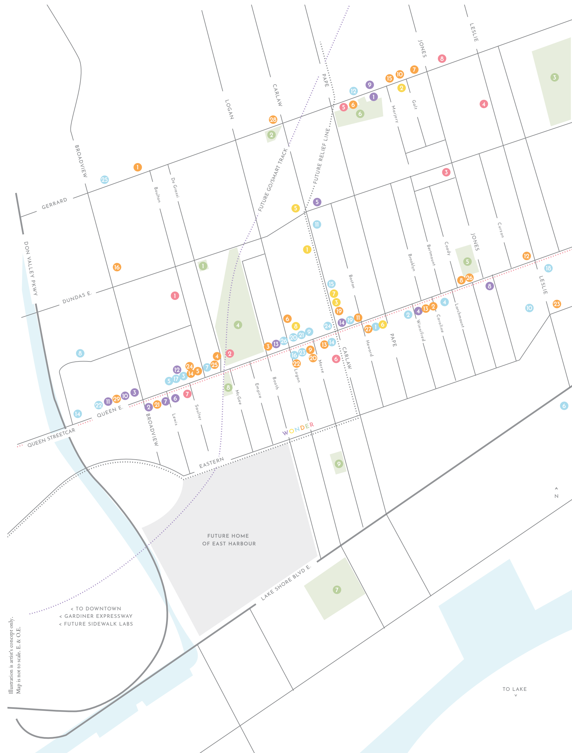
Illustration is artist's concept only. Map is not to scale. E. & O.E.

< TO DOWNTOWN < GARDINER EXPRESSWAY < FUTURE SIDEWALK LABS