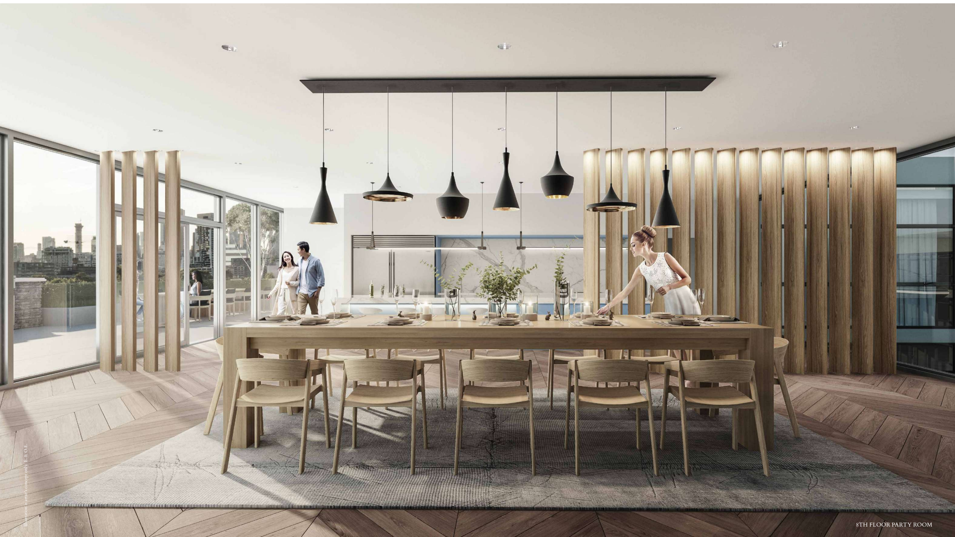
Illustration is artist's concept only. E. & O.E.