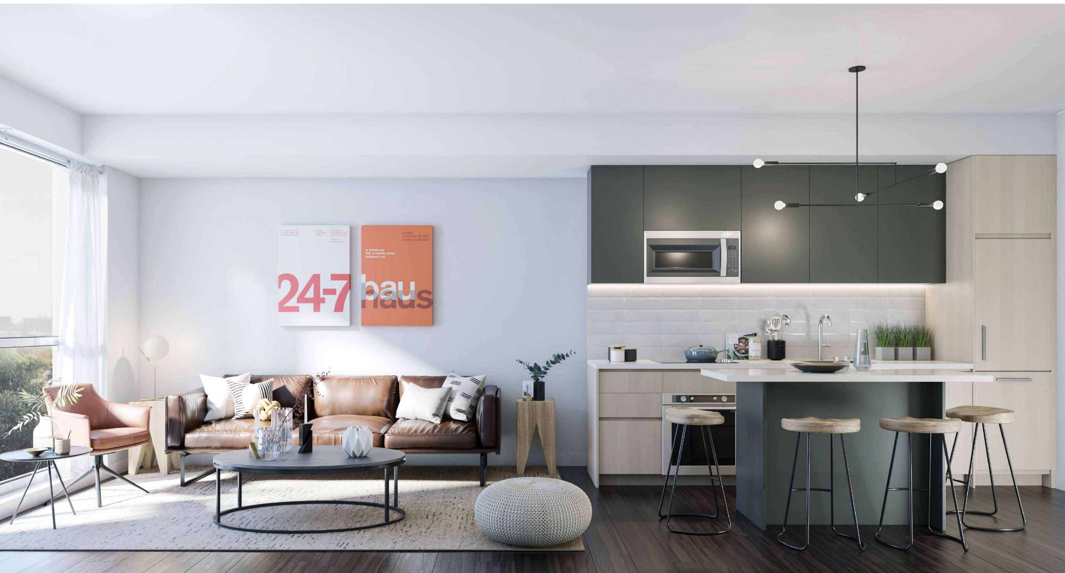
Interior rendering is artist's concept. Actual usable floor space, window dimensions and finishes are subject to change without notice. Furnishings, lighting fixtures and accessories are not included in the standard finishing package. E. & O.E.