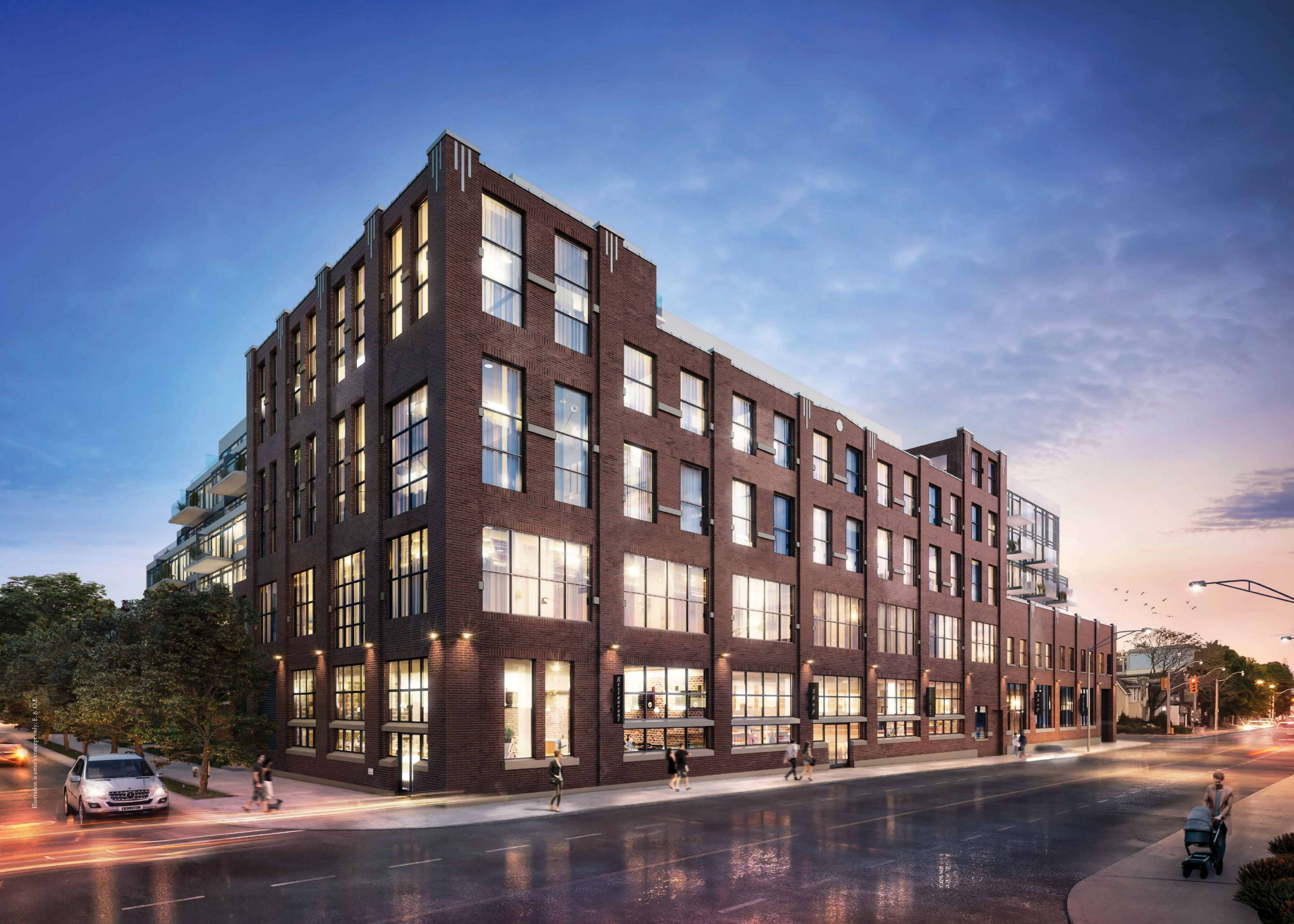
Illustration is artist's concept only. E. & O.E.